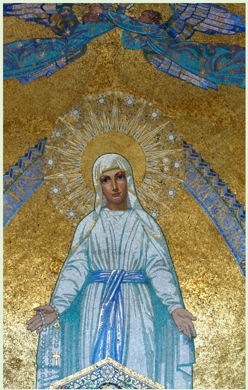
Mosaic before the Basilica of Our Lady of the Rosary, Rosary Square, Lourdes

In this monthly reflection, St Beuno's Outreach invites you to pray with an image and a verse of Scripture or other material.